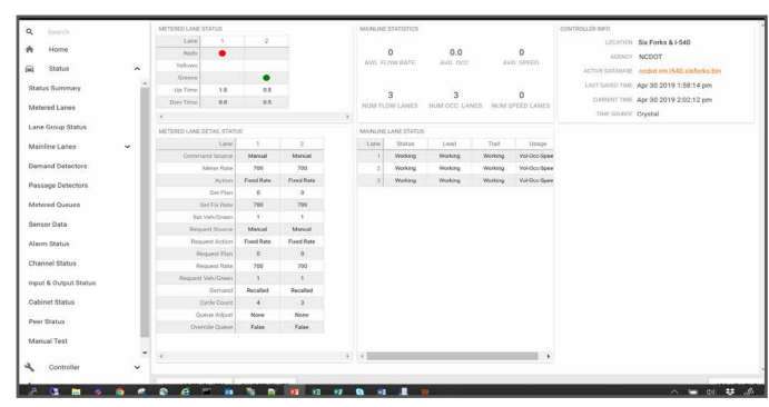
MAXTIME rm home screen